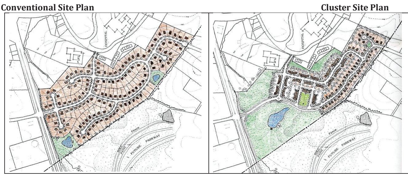
Graphic courtesy of Paradigm Design